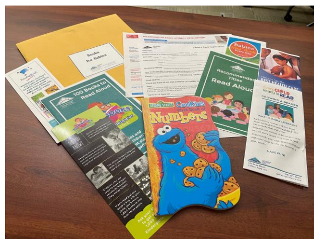
The contents of one of our Books for Babies Parent or Grandparent bag.

The Library and the Friends publicize the dates prior to those two weeks each year when the program is offered.