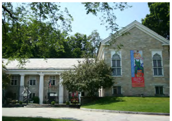
Bennington Museum, Bennington, Vermont