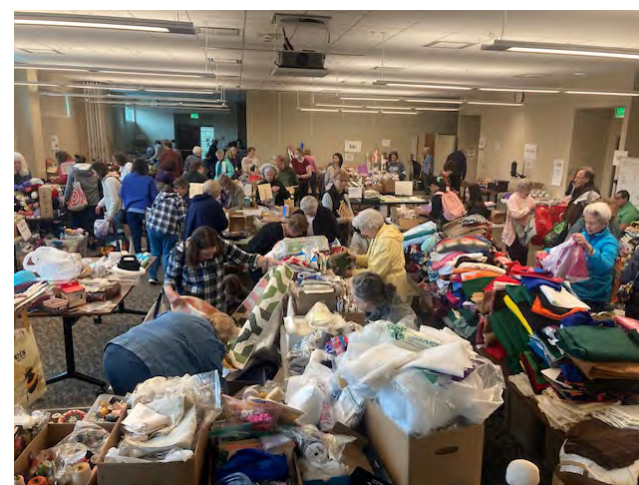
Our Give and Take was an excellent recycling program!