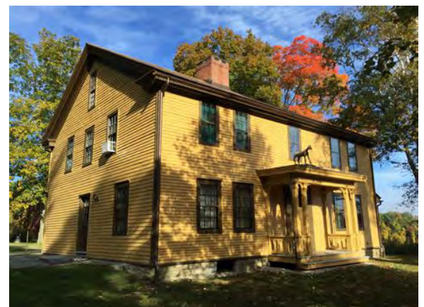
Arrowhead House Museum, Pittsfield, Massachusetts